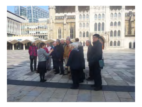
Guildhall and the city of London.. Our very knowledgable guide had a ready

he march London walk was to Guildhall and we had a superb guide to show us around and explain many of the traditions and customs associated with