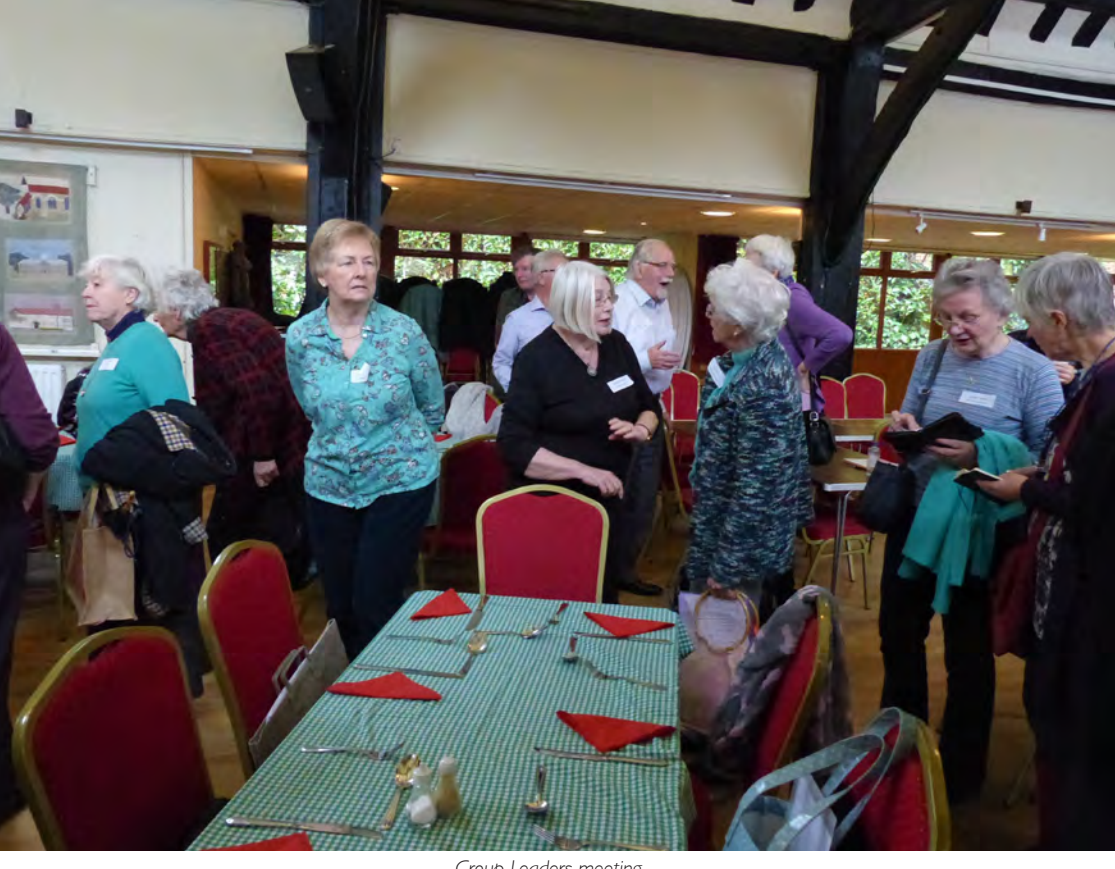
Group Leaders meeting