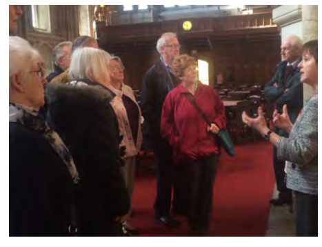
We also learnt about the guilds and freeman of the city's rights. The Guild of Mercers was one of the oldest guilds and many still have their

the depth of water around the ship and did not always drop the lead weight to the bottom. 'Money for old rope' apparently originated from the hangman who went to the pub after he had finished his work and sold pieces of the rope he had been using earlier!