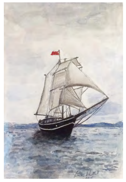
Brian Whittet's watercolour