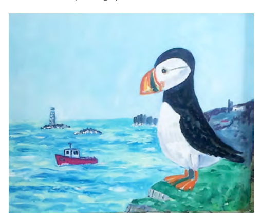
An acrylic painting by Eric Flint