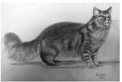
Pencil drawing by Rita Pitcher